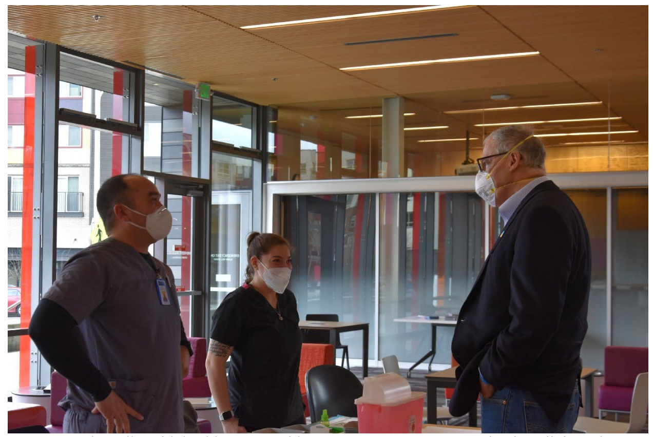
Gov. Jay Inslee talks with health care providers at a pop-up COVID vaccination clinic at the Tukwila Library on March 1.

Ongoing COVID funding was also included to continue efforts related to vaccinations, testing, and monitoring disease and variant activity. These funds also provide local health departments with funds to operate community-level COVID activities. Additional funds were also provided to support additional capacity in long term care in order to relieve strain on hospital capacity.