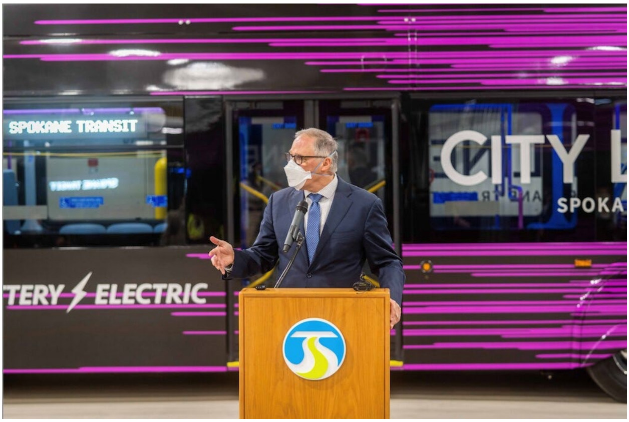
Gov. Jay Inslee speaks following a tour of the Spokane Transit Authority's electric bus fleet Feb. 18.